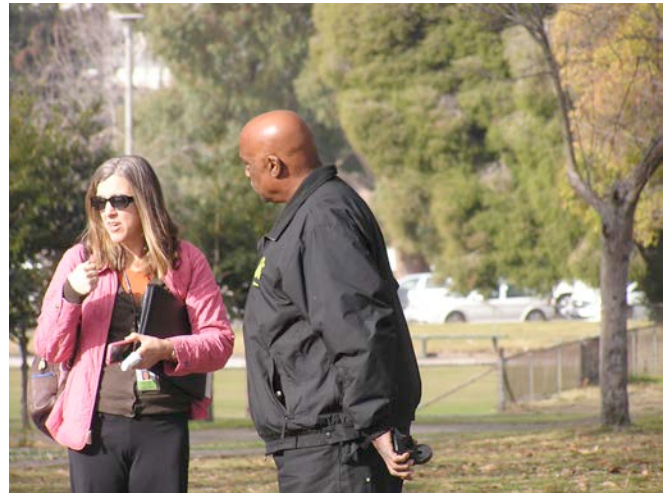
City staff discuss installation details.