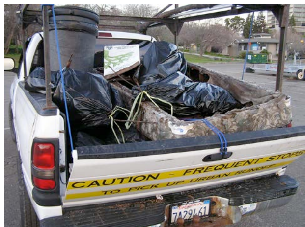
Some idiot dumped a box spring in the Lake!

This edition of "Tidings" was published entirely with private funding donated to the Lake Merritt Institute, and not with funds from the City of Oakland. To contribute to the Institute, use PayPal at our website or send a check to: The Lake Merritt Institute, 568 Bellevue Avenue, Oakland, CA 94610.