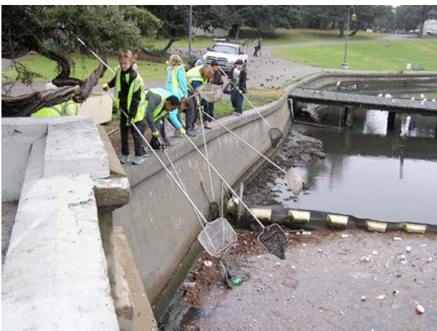
St. Paul's students clean up.