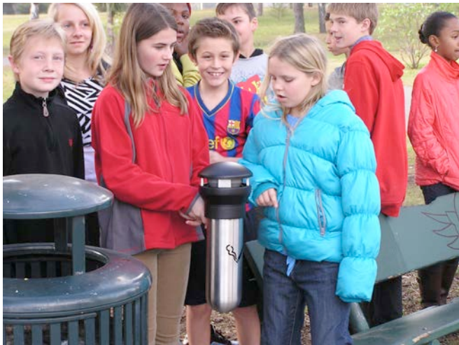
St. Paul's Students admire the ash tray.

ASH TRAY PROJECT: Cigarette counting students, city staff and volunteers met at the McElroy fountain last month to pick out a site for the first two outdoor ash trays ever to be installed in Lakeside Park. The style chosen will be similar to that shown below, but mounted in a post secured by cement into the ground. Students will maintain them, counting their catch and comparing that to previous data. As of mid-February, installation had started, but was not complete. Stop by this beautiful fountain to see history in the making.