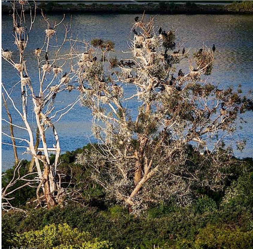
Cormorant nests: Photo by Lee Aurich

In between the time of the algae and a flourish of geese, cormorants raise their young on the islands, trees are full of birds, and boats ply the waters. Life is blossoming at Lake Merritt; come on down to the bottom of the watershed and be part of it.