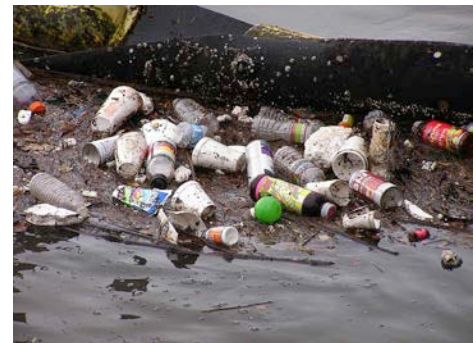
Litterbugs: STOP IT! There are ducklings at play here.

This edition of "Tidings" was published entirely with private funding donated to the Lake Merritt Institute, and not with funds from the City of Oakland. To contribute to the Institute, use PayPal at our website or send a check to: The Lake Merritt Institute, 568 Bellevue Avenue, Oakland, CA 94610.