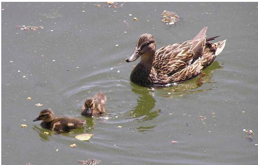
Mallard ducklings: Probably only a few days old.