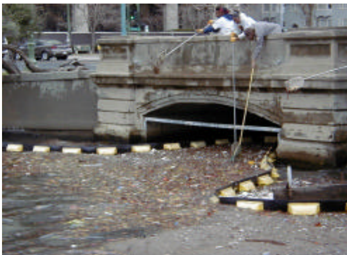
Glen Echo Cove After a Rain

CHRISTMAS TREES AND TRASH – A BAD COMBINATION: Who wants to see a litterbug's bottles floating next to the reflections of seasonal lights? Not Santa Claus! So he is asking you to come down to the Lake on a Tuesday at 10:30 or Saturday at 10 and help remove the nasty stuff. People who don't have been known to get coal in their stocking.