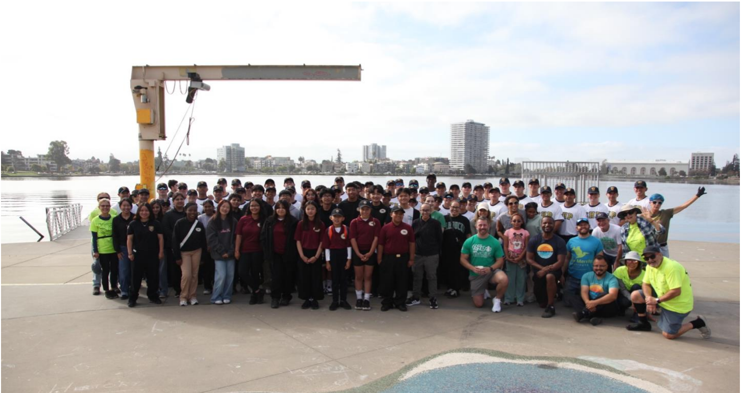
9/20/25- Creek to Bay Day volunteers at LMI collected 89 bags