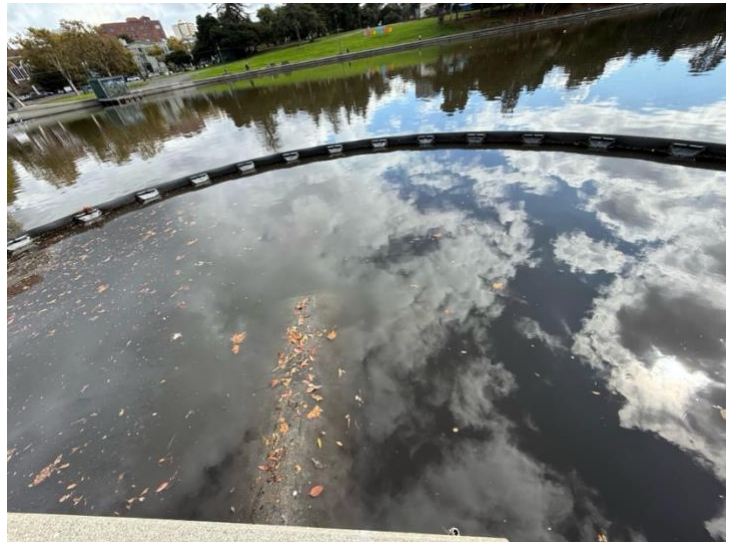
Before & After First Flush Cleanup at Lake Merritt Institute 10/14/25