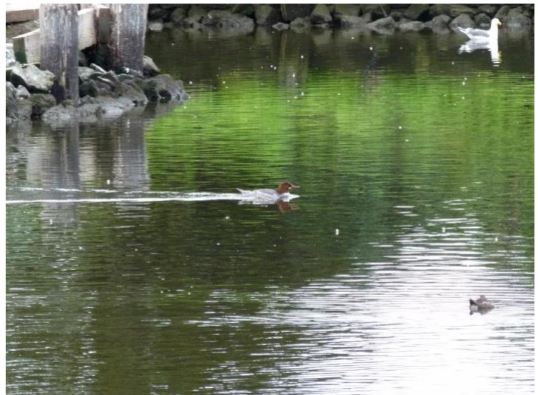
Common Merganser, photo by Katharine W. Cook, February 25, 2026

We had Forster's Terns again, making further nonsense of last November's prediction that we wouldn't see them all winter even though some always stay in the Bay Area. This year, they're not only nearby, they're coming here to fish! With less competition than I'd have liked, but enough to make a cheerful scene – lots of Bufflehead and Ruddy Ducks (some well on the way to turning truly ruddy), lots of Double-crested Cormorants of all ages (none yet starting to refurbish last year's nests or pick out new spots), and one female Common Merganser who showed up a couple of times during the walk (once spotted by a new birder in the group, who asked, “What's that long bird swimming by the rocks?”) Co-leader Kat got a good photo of a lovely, long swimming merganser, but see if you can find a photo online of a close-up profile – they're not called “sawbills” for nothing!