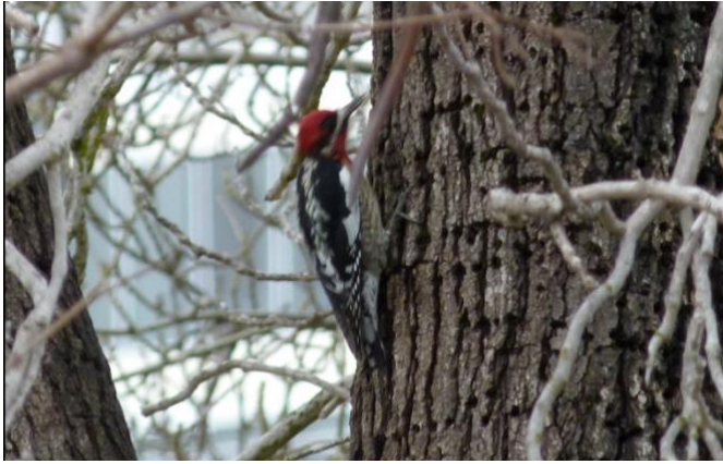
Red-breasted Sapsucker working its way up a trunk, February 25, 2026

When we got into the garden, we sat under the big oak in the composting area and held out seeds for a while, but I decided we weren't getting any takers, said I was moving on, and headed over to the cement platform by the monkey-puzzle tree – where I turned to discover I was all alone. After sitting for a few minutes, I headed back to check on the delay, only to find the whole composting area jumping with birds – Scrub Jays and Oak Titmice ogling the humans from the branches and our resident Chestnut-backed Chickadees picking through the hand-held offerings. So I was the sacrifice – the one who leaves an empty birding site right before the birds show up – and could feel I'd done my job. Even if nobody followed me.