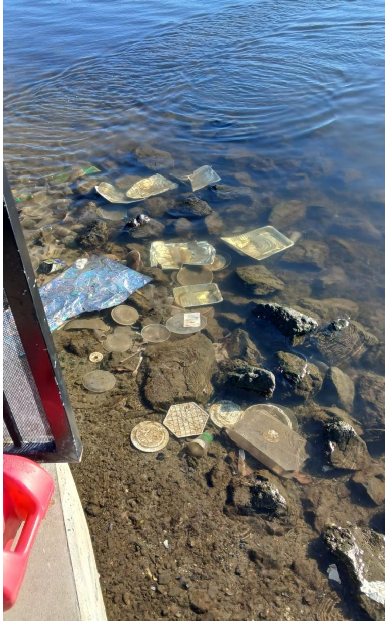
1/8/26 food containers, plates, cups, and utensils floating in the water at Lake Merritt before LMI volunteers cleaned the area using nets.

As we clean up the lake each week, it feels cathartic (and even a little self-righteous) to complain about nameless neighbors littering. But maybe it's worth considering that the ubiquity of plastic in our modern environment is also a culprit. On a societal level, we produce and consume a whole lot of plastic. From that perspective, corporate and regulatory responsibility are every bit as important as personal responsibility.